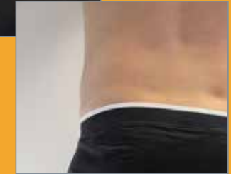
8 weeks after treatment