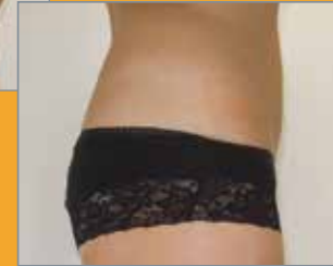
8 weeks after treatment